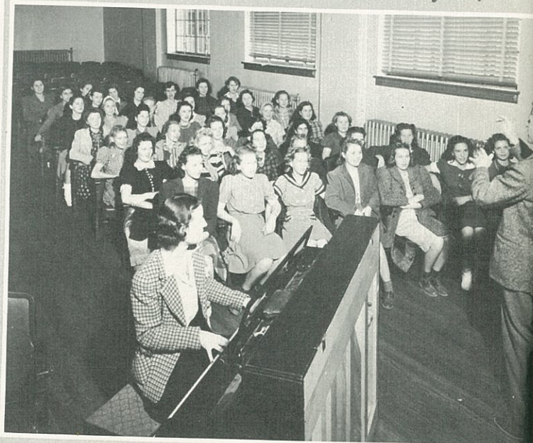
Glee Club Practice